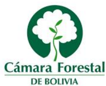
Bolivia's Forestry Chamber