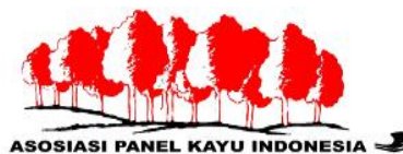
Indonesian Wood Panel Association